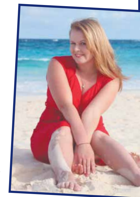
By Claire Prior

For more information, or to purchase tickets, contact 294-0204 or visit Oceans Gift Shop at BUEI.