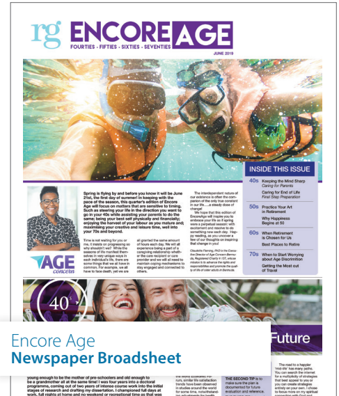
Encore Age Newspaper Broadsheet

This product lends itself to our newspaper features: Mother's Day and Open Bermuda Day to name a few. Inserted in the daily, we use bleached newsprint for these features, which makes the features stand out and very popular with advertisers and readers alike.