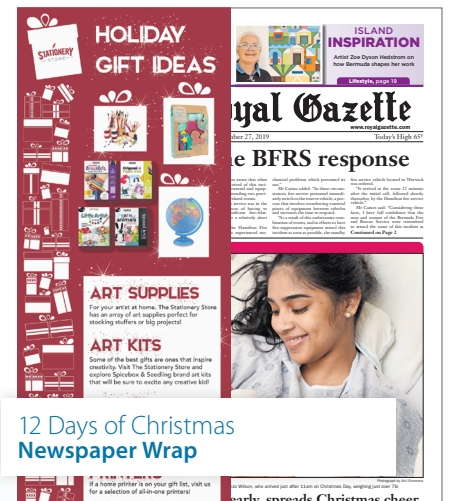
12 Days of Christmas Newspaper Wrap